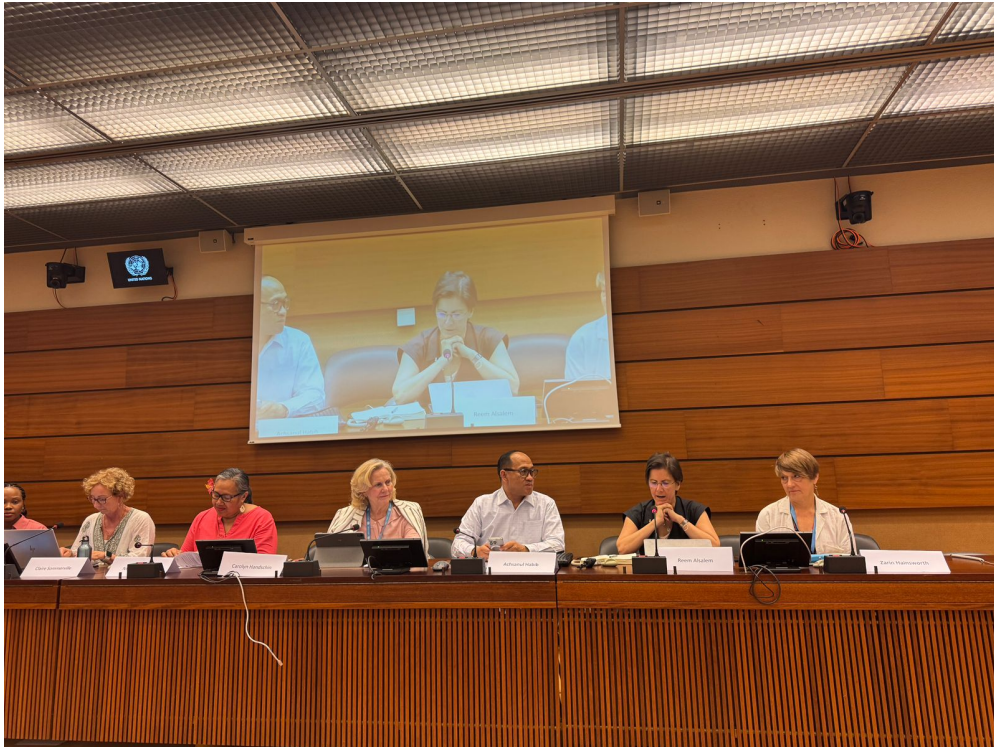
HRC 59 Side event: WFWPI supported by NGO CSW Geneva and WRI: Speakers: SR on VaW, UNODC, Amb of Indonesia, Amb of Samoa, Graduate Institute, WRI, WFWPI.

Upcoming events include: Conference at UN Geneva on October 16 on “No Peace without Women / No More War”; LATraining HRC60 program September 7-8.